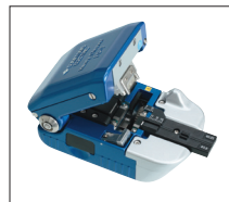
Handy cleaver FC-7 / FC-7R series