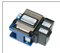
Table-top cleaver FC-6 / FC-6R series