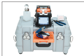
Carrying case with worktable CC-71+

At least, the above basic accessories come with splicer main body. Some additional accessories may be or may not be included as a splicer standard kit contents. The standard splicer kit contents varies in each region/country. Please ask details to your nearest distributors.