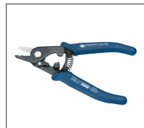
Jacket remover JR-M03